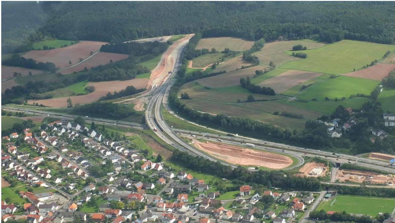
A view of the Kirchheim autobahn intersections under construction in December, 2017. This view is approximately east, towards Bad Hersfeld, along the A-4. The A-7 runs left-to-right in this photo, with north to the left edge. There would have been more vegetation here in the mid-1980's. The autobahn would not have been as wide as is seen here.